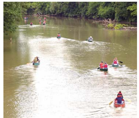
Members participate in a canoe float on the Sandusky River. The SRWC holds 2 floats each summer, rotating between Crawford, Sandusky, Seneca, and Wyandot Counties.