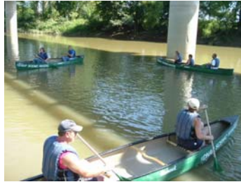
Over 25 people participated in the canoe floats.

mals. This was a great opportunity for people to get up close to one of these amazing birds. Thanks to BTW for taking part in our program.