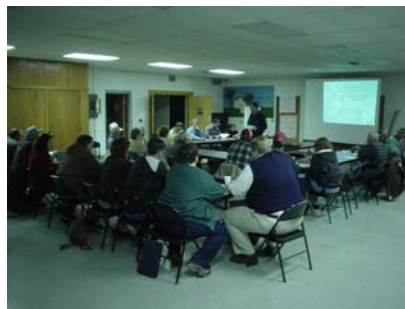
Planning meeting for Honey Creek.

Subwatershed planning is underway for the Honey Creek and Broken Sword Creek Watersheds. Meetings were held earlier this year to get public input on a variety of issues that will be addressed in the plans. Drafting of some initial text began in August, and we may have to hold another public meeting to get additional input before the drafts can be completed. It will likely be early winter before another meeting is held due to the busy