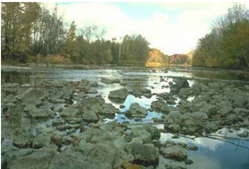
The Sandusky River—an Ohio State Scenic River...

The Ohio Division of Natural Areas and Preserves is responsible for administering the Ohio Scenic Rivers Program, whose mission is to preserve and protect the natural qualities of Ohio's finer streams in order to maintain water quality and the habitat for stream organisms, and that present and future generations may experience their natural beauty and values. For over 35 years, Ohio has maintained a national leadership role in river