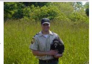
ODNR DOW Bald Eagle Banding Event—Killdeer Plains Wildlife Area

same goals is always a great time, and you can make a difference in your community.